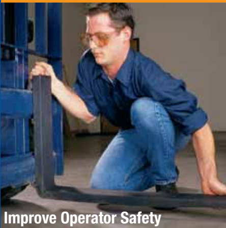
Improve Operator Safety