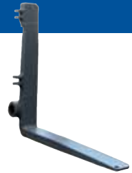
Hydraulic Attachment Fork