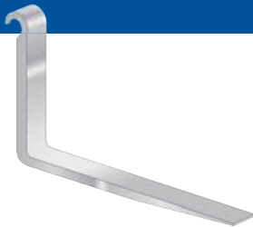
Quick Disconnect Fork